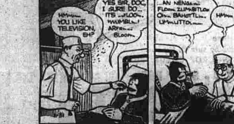
BOOTS AND HER BUDDIES BY EDGAR MARTIN