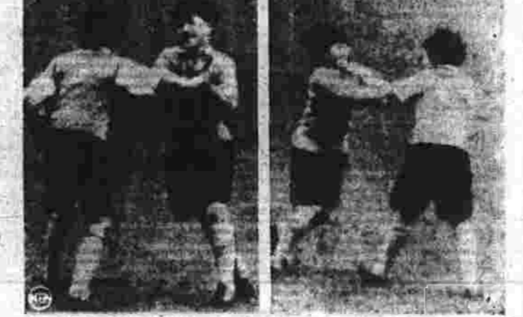
Boys Will Be Boys—This four-way combo shows Prince Charles swapping punches with a fellow pupil on Jan. 28, the second day of his unprecedented attendance at an exclusive London boys' school.