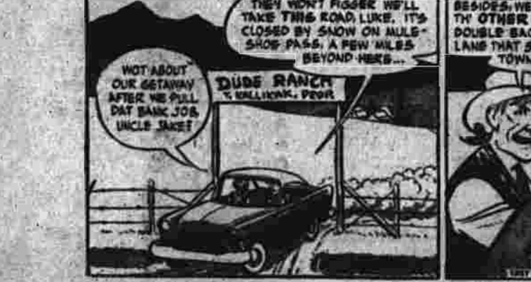
MORTY MEEKLE BY DICK CAVALLI